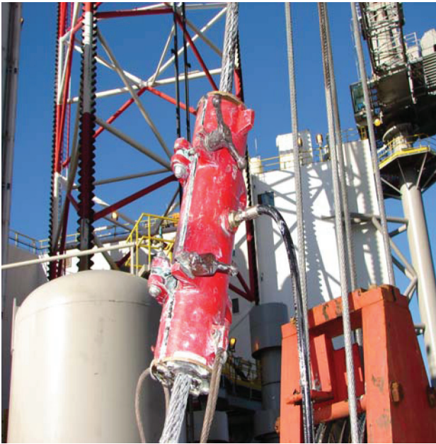
Power Lubricator in use on an offshore contractor's rig